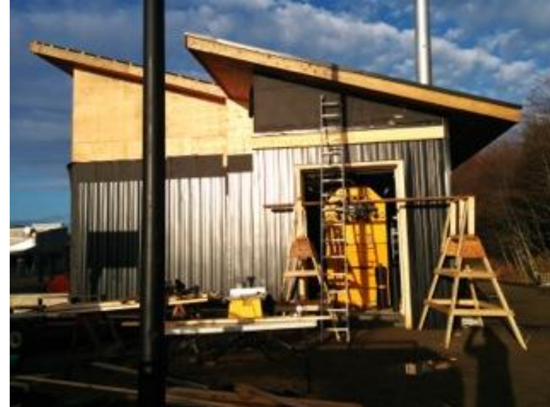
Old Massett Village Council - District Heating System