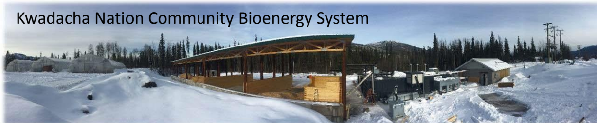
Kwadacha Nation Community Bioenergy System