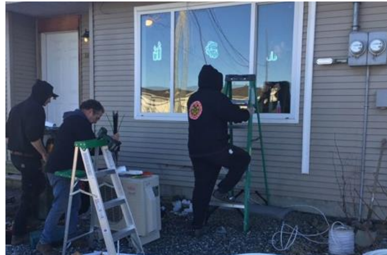
Heiltsuk Heat Pump Installation – Vancouver is Awesome