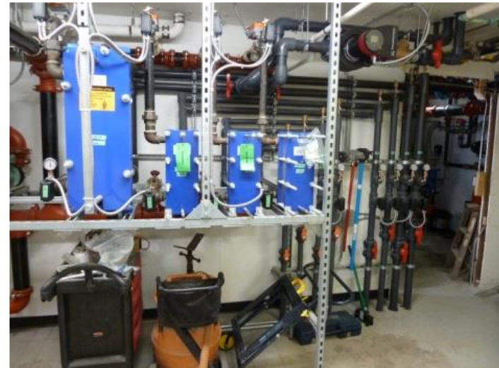
District of Saanich – Boiler Replacement